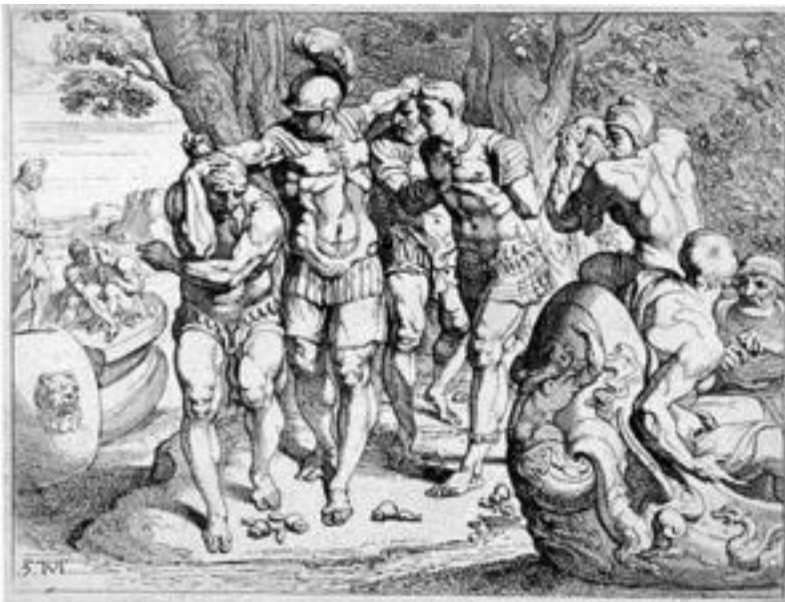
Ulysses removing his men from the company of the lotus-eaters

Ulysses, who feared that other people were also tempted, gathered the rest of his crew. They reloaded quickly and soon raised anchor.